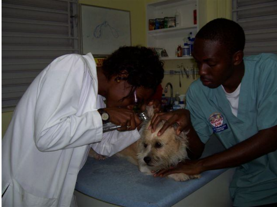
Above: Examining an ear with an otoscope

The veterinarian will recommend treatments that involve flushing or irrigation (cleaning) of the ear, usually with a liquid or oil-based mixture, to help in removing the wax-build-up. It will also involve instilling ear medications – ointments or drops – that will require the ear canal being ‘made vertical’, by gently pulling on the ear upwards. Oral (in the mouth) medications (tablets or capsules) are also prescribed. It is important that one sticks to the regimen recommended, as ear infections can lead to more serious conditions as haematomas (swollen ear flaps due to broken blood vessels inside the flap) which will require surgery and infections of the brain.