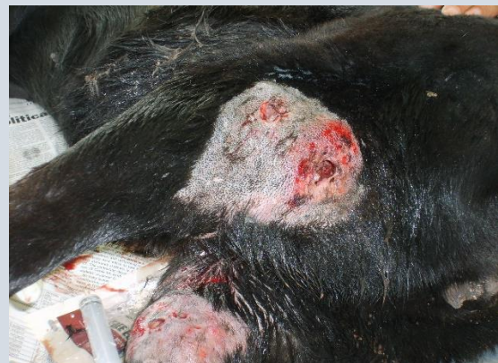
Bite wounds on a goat

The effects of dog predation are real and apparent and it is now recognized as a major problem for sheep/goat farmers. I encourage